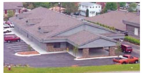
Scott Mallard Kidney Dialysis Center