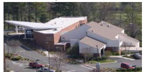
Seby B. Jones Regional Cancer Center