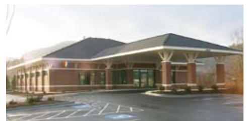
Outpatient Imaging & Lab Center