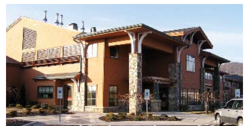
Paul H. Broyhill Wellness Center

For more information, call (828) 268-9403